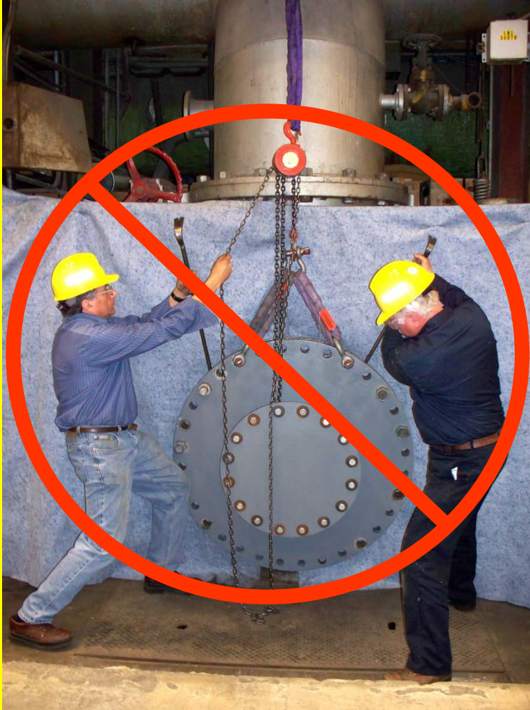
OLD METHOD - RISKY - LABORIOUS