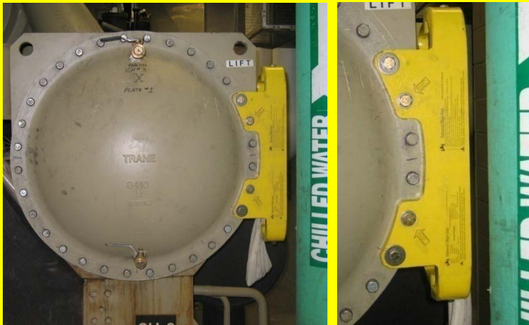
THE UH Brand BOLT ON HINGE INSTALLED ON A CHILLER WITH OPTIONAL KEEP IN PLACE KIT