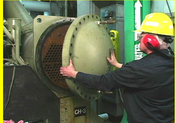
NEW METHOD - SAFER - EFFICIENT