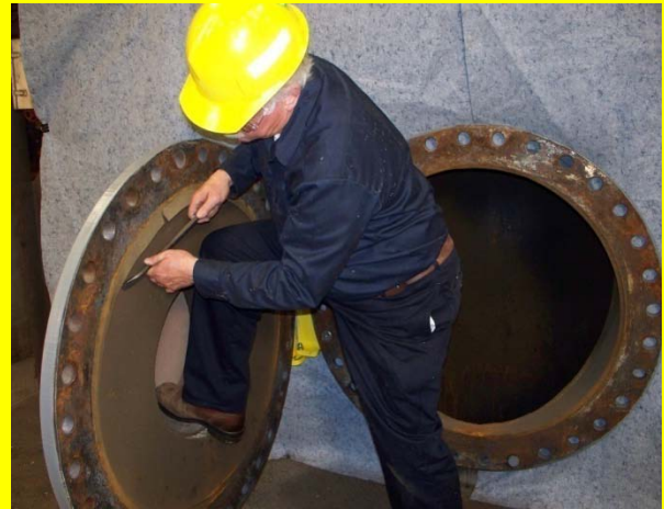
MANWAY INSPECTION COVER OPEN VESSEL MAINTENANCE IN PROGRESS UTILIZING UH Brand BOLT ON HINGE